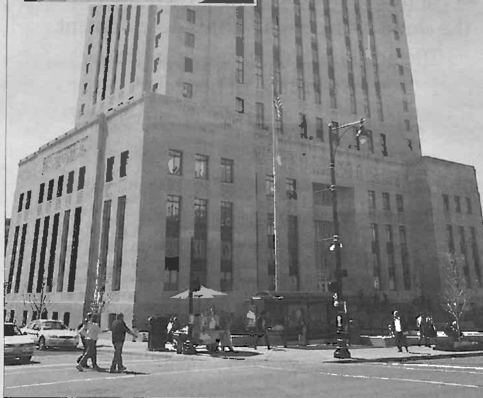
The Jackson County Courthouse was the site of a trial over whether workers were harmed by asbestos at the Jackson County Courthouse. Above, a notice informs the public that the air in the courthouse has cleared state and federal standards.